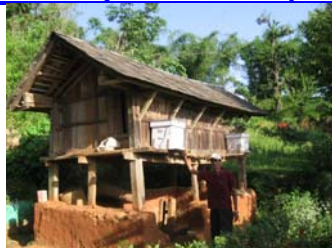
Traditional grain storage