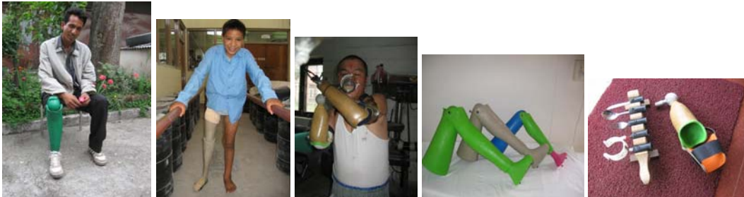
MEND's plastic limbs and tools for daily living get field testing in Nepal.