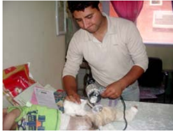
cutting off foot and leg casts