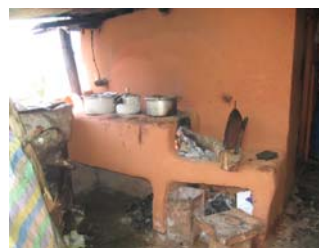
wood-fired kitchen in Nepal