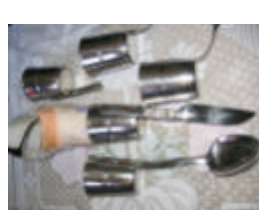
Earlier prototype of tools for daily living skills