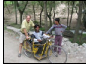
Local man shows us his hand tricycle