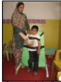
Standing frames train bodies to stand tall