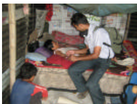
So valuable are home visits to check disabled kids