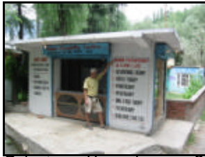
Rob at new Hope shop