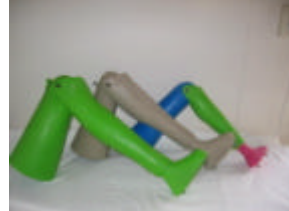
Fitting is simple, fast and clean. No toxic resins are used in making rotolimbs. Nuts cast into plastic so that rubber soles can be fastened by bolts. Limb colours should be fun for children which makes them feel special!