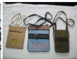
Laptop bags cost about $25 NZ